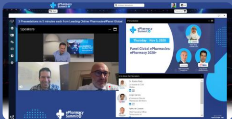
Utilizing the best platform